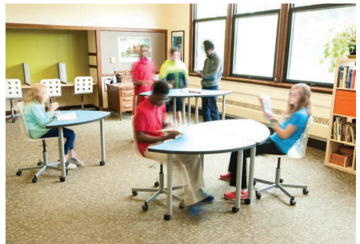
Half-Moon and 1-Person Tables