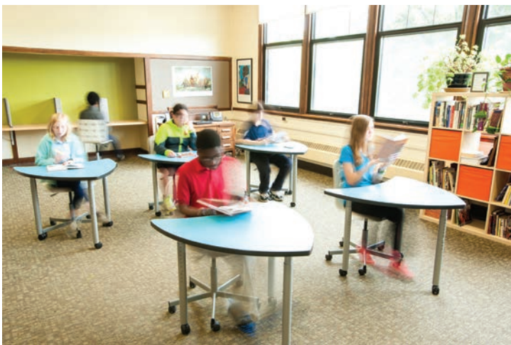
1-Person Tables in Lecture Layout