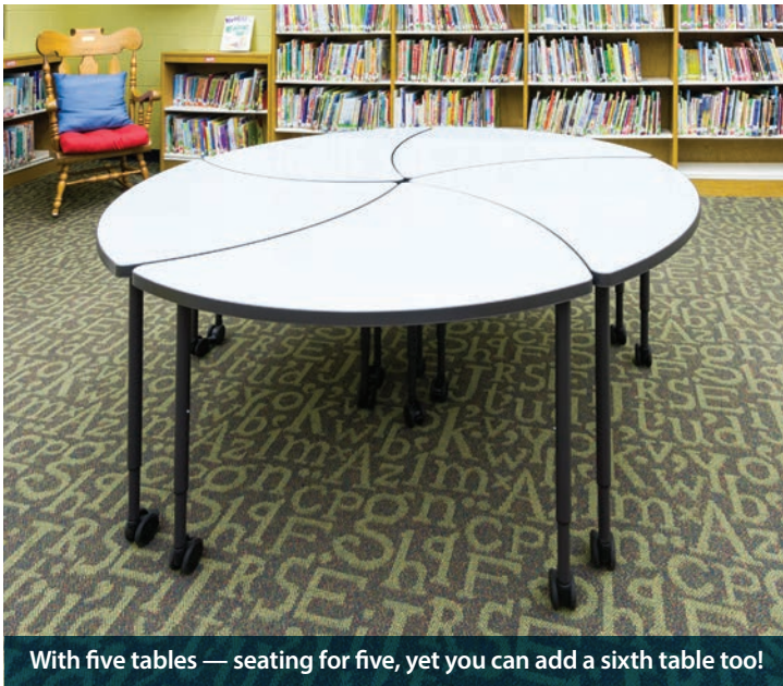
5-Person Collaborative Table Layout